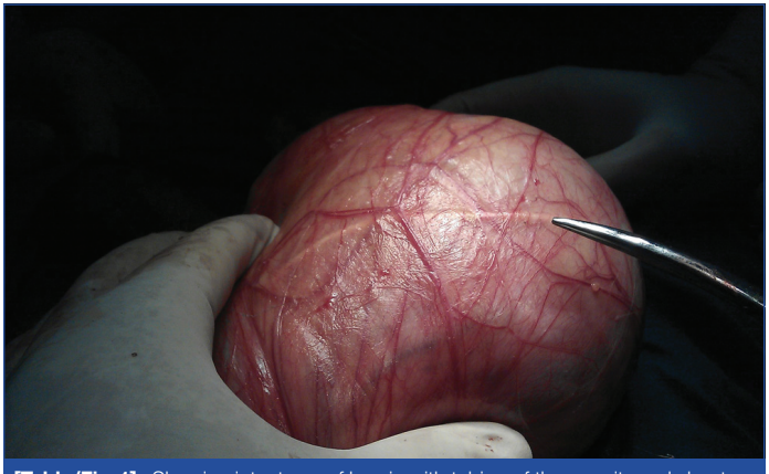
[Table/Fig-1]: Showing intact sac of hernia with tubing of thecoperitoneal shunt.

Patient had an uneventful post-operative recovery. He was followed for six months to detect any complication like CSG leak, recurrence of hernia etc but there was none.